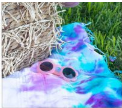
3. Picnic Blanket