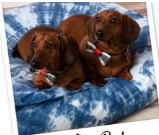
4. Dog Bed