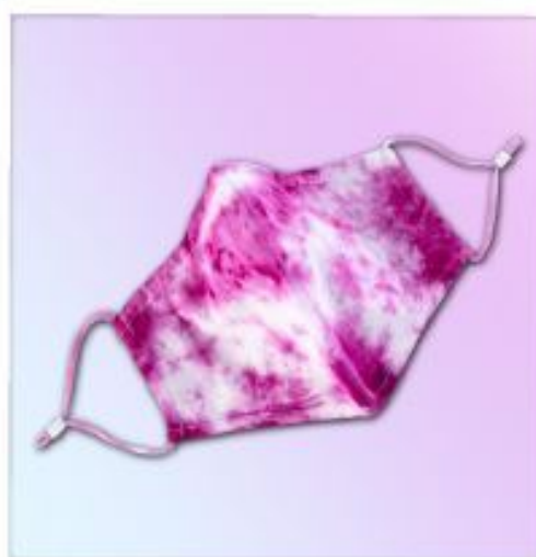
8. Face Mask