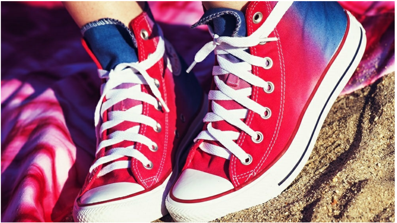
Who doesn't love color? We sure do! These rainbow shoes go great with any outfit this summer!