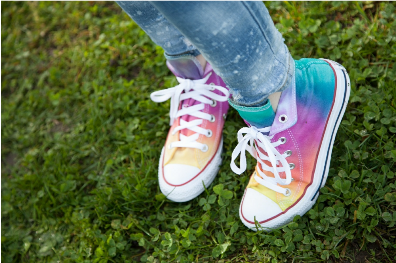
Here's the same idea, with a different pattern.